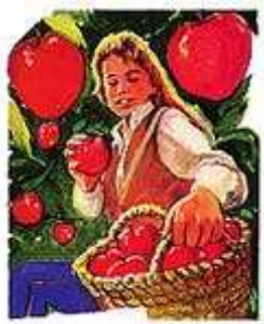
God prescribed a vegetarian diet for Adam and Eve.

Note: No person can eat his way into heaven. Eating even the food of angels will not entitle people to paradise. Only acceptance of Jesus Christ as Lord and Saviour can do that. Ignoring God's health laws, however, may cause a person to be lost, because it will ruin his judgment and cause him to sin.