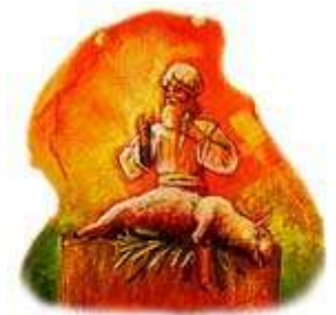
Noah's sacrifice of a clean animal (Genesis 8:20) shows that he understood the difference between clean and unclean.

Answer: No indeed! The Bible has ample evidence that there were clean and unclean animals from the very dawn of Creation. Noah lived long before any Jews existed, but he knew of the clean and unclean, because he took into the ark the clean animals by "sevens" and the unclean by "twos." Revelation 18:2 refers to some birds as being unclean just before the second coming of Christ. The death of Christ had no altering effect whatever on these health laws, since the Bible says that all who break them will be destroyed when Jesus returns (Isaiah 66:15-17). The Jew's stomach and digestive system in no way differs from that of a Gentile. These health laws are for all people for all time.