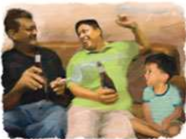
Drug-using parents often transmit weaknesses to their children.