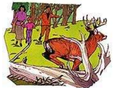
Exercise in the great outdoors will help us prepare for heaven.

Answer: Nothing defiling or unclean will be permitted in God's kingdom. All filthy habits defile a person. Use of improper food defiles a person (Daniel 1:8). It is