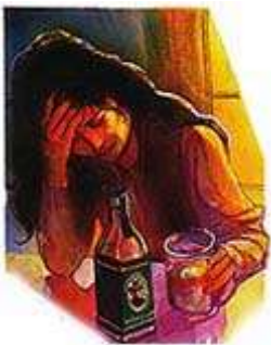
The use of alcoholic beverages is clearly condemned by Scripture.