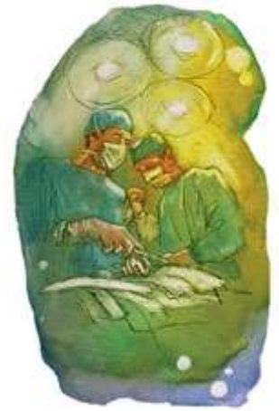
Ignoring God's health laws is a sure way to end up in surgery.

Answer: The answer is too plain to miss. Those who break God's rules regarding the care of the body machine will reap broken bodies and burned-out lives, just as one who abuses his automobile will have serious car trouble. And those who continue to break God's laws of health will ultimately be destroyed by the Lord (1 Corinthians 3:16, 17). God's health laws are not arbitrary. They are natural, established laws of the universe, like the law of gravity. Ignoring these laws always brings certain disastrous results. The Bible says, "The curse causeless shall not come." Proverbs 26:2. Trouble comes when we ignore the laws of health. God, in mercy, tells us what these laws are so we may avoid the tragedies that result from breaking them.