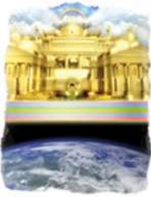
The holy city, along with all God's people, will descend to earth at the close of the 1,000 years.