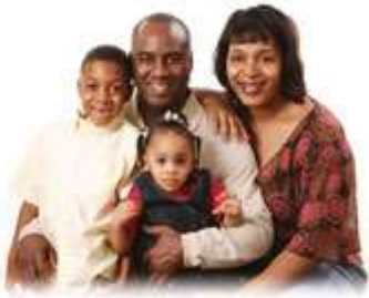
These four people are four souls.

"And the Lord God formed man of the dust of the ground, and breathed into his nostrils the breath of life; and man became a living soul." Genesis 2:7.