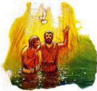
Jesus was baptized by immersion.

Note: The devil's "buffet" plan for baptism says, "Take your pick. The method of baptism doesn't matter. It is the spirit that counts." But the Bible says, "One Lord, one faith, one baptism." Ephesians 4:5. It also says, "Obey, I beseech thee, the voice of the Lord." Jeremiah 38:20.