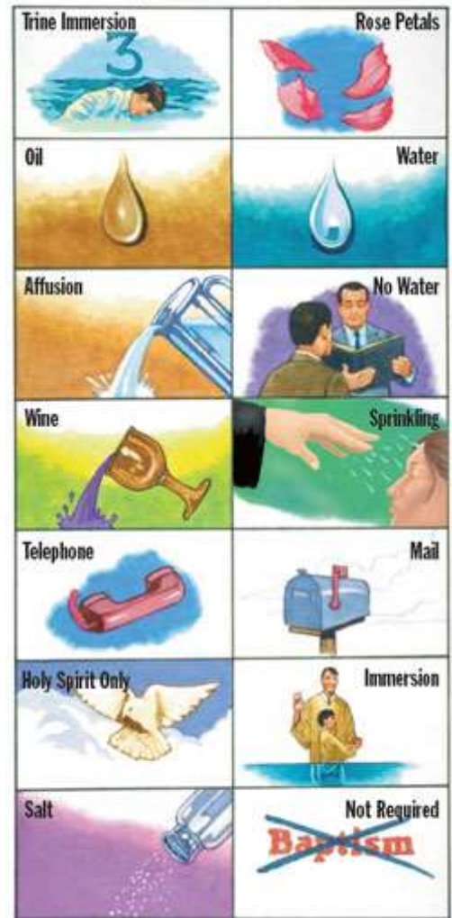
Only ONE method of baptism is biblical, not 14.