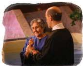
God is pleased with people who are baptized by immersion. Is He pleased with your baptism?