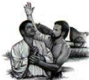
Philip baptized the Ethiopian by immersion.

"They went down both into the water, both Philip and the eunuch; and he baptized him. And when they were come up out of the water, the Spirit of the Lord caught away Philip." Acts 8:38, 39.