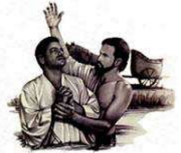
Philip baptized the Ethiopian treasurer the same day he accepted Christ as his Saviour.

Certainly no truly converted person would want to delay baptism, which publicly pays tribute to Jesus for working all these miracles.