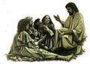
Jesus taught that He will return to earth the second time.

Answer: Yes! In Matthew 26:64, Jesus testified under oath that He would come back to this earth again. Since the Scripture cannot be broken (John 10:35), this is proof positive. Believe it just as it reads. It is Christ's own personal guarantee.