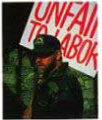
Strife between capital and labor is a sign of Jesus' second coming.

Fulfillment: This is the next great event. Are you ready?