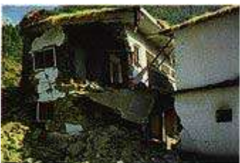
Today's earthquakes are minor in comparison with the massive earthquake at Jesus' coming.