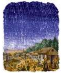
The great star shower took place on November 13, 1833.

Fulfillment: The great star shower took place on the night of November 13, 1833. It was so bright that a newspaper could be read on the street. One writer says, "For nearly four hours the sky was literally ablaze."* Men thought the end of the world had come. Look into this. It is most fascinating, and a sign of Christ's coming.