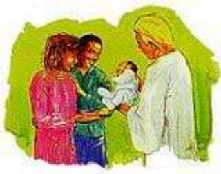
Little babies taken from their parents by death will be returned to them at Jesus' second coming.

"For the Lord himself shall descend from heaven ... and the dead in Christ shall rise first: Then we which are alive and remain shall be caught up together with them in the clouds, to meet the Lord in the air: and so shall we ever be with the Lord." 1 Thessalonians 4:16, 17.