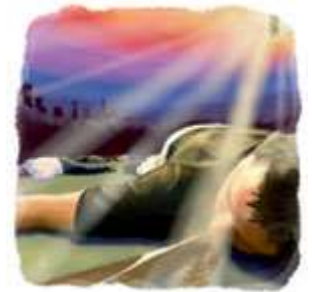
The wicked will be slain at Jesus' second coming.

Answer: The wicked will be slain by Jesus.