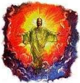
Jesus said He will return to earth in the clouds.