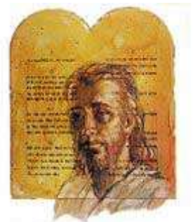
Jesus says it is easier for heaven to pass away than for God's law to change.

Answer: No, indeed! It is utterly impossible for any of God's moral law ever to change. All Ten Commandments are binding today.