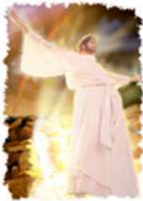
The Sabbath was not changed to Sunday at the time of Jesus' resurrection.

Answer: The apostles in the early New Testament church not only obeyed God's Sabbath command, but they also taught the converted Gentiles to worship on Sabbath. Never once do they refer to Sunday as a holy day.