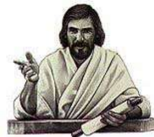
When Jesus was here on earth, He worshiped on the Sabbath.

Answer: Jesus' custom was to worship on the Sabbath.