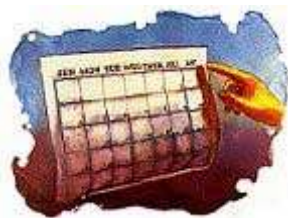
The seventh day of the week (Saturday) is the Sabbath.