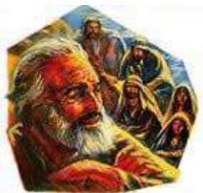
Paul and the other apostles kept God's seventh-day Sabbath holy.