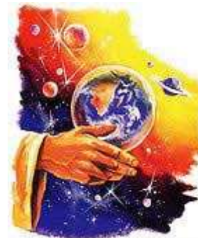
God made the Sabbath at the time of Creation.

Answer: God made the Sabbath at the time of Creation, when He made the world. He rested on the Sabbath and blessed and sanctified it (set it apart for a holy use).