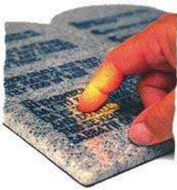
God wrote the Sabbath commandment with His own finger.