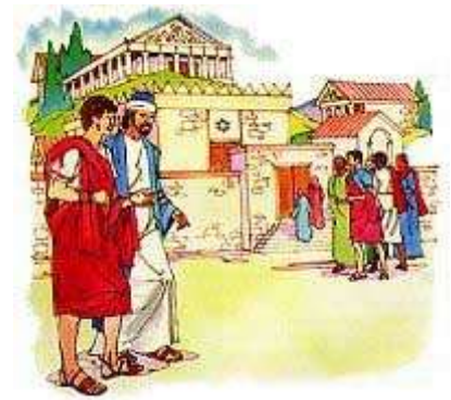
The apostles taught the Gentiles to keep the Sabbath holy.

Acts 13:42, 44, emphasis added. "And he reasoned in the synagogue every sabbath, and persuaded the Jews and the Greeks." Acts 18:4.