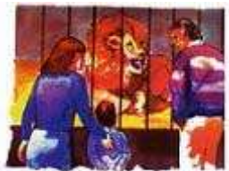
The law protects us from the devil as a cage protects us from the lion at the zoo.

Special Note: The eternal principles of God's law are written deep in every person's nature by the God who created us. The writing may be dim and smudged, but it is still there. This means, of course, that you cannot find true peace unless you are willing to live in harmony with your inner nature, upon which God has written these principles. We were created to live in harmony with them. When we choose to ignore them, the result is always tension, unrest, and tragedy, just as ignoring the rules for safe driving leads to serious trouble.