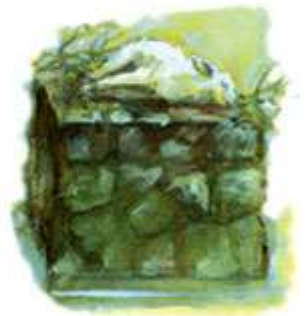
Ceremonial sacrifices and rituals pointed forward to Jesus' sacrifice.

Note: Moses' law was the temporary, ceremonial law of the Old Testament. It regulated the priesthood, sacrifices, rituals, meat and drink offerings, etc., all of which foreshadowed the cross. This law was added "till the seed should come," and that seed was Christ (Galatians 3:16, 19). The ritual and ceremony of Moses' law pointed forward to Christ's sacrifice. When He died, this law came to an end, but the Ten Commandments (God's law) "stand fast for ever and ever." Psalms 111:8. That there are two laws is made crystal clear in Daniel 9:10, 11.