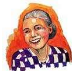
With Jesus living in the heart, the dark, ugly past is replaced by His triumphant indwelling.

"I will put my laws into their mind, and write them in their hearts." Hebrews 8:10. "I can do all things through Christ." Philippians 4:13. "God sending his own Son ... That the righteousness of the law might be fulfilled in us." Romans 8:3, 4.