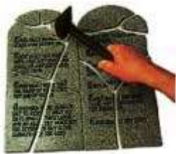
God says that sin is breaking His law.