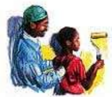
Happiness follows those who keep His commandments.

"By the law is the knowledge of sin." Romans 3:20. "I had not known sin, but by the law: for I had not