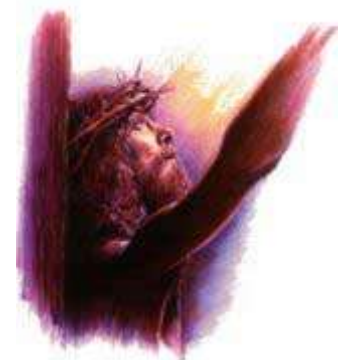
The cross is positive proof that the law is unchangeable.

Answer: Absolutely not! The Bible is very clear on this point. If the law could have been changed, God would have immediately made that change when Adam and Eve