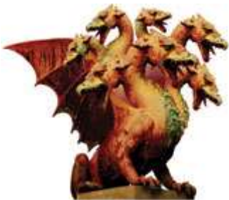
And the dragon was wroth with the woman [true church].