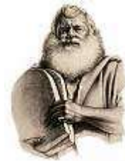
And the tables were the work of God.

Answer: Yes, the great God of heaven wrote the Ten Commandments on tables of stone with His own finger.