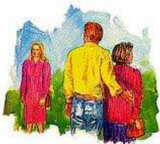
The wrong kind of thinking can destroy your marriage.