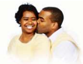
With true love, your marriage cannot fail.

Answer: Family intimacies must never be shared with others--not even with parents. It is a great sin and a tragedy to break this God-given rule. A third person to sympathize or listen to complaints is a tool of the devil to estrange the hearts of husband and wife. Solve your home problems privately. No one else (except your minister or marriage counselor) should ever be involved. Always be truthful with each other, and never keep secrets from each other. Tell no jokes at the expense of your spouse's feelings. Vigorously defend each other, and strictly exclude all intruders. And as for adultery (in spite of what some marriage counselors say), it always hurts you and everyone else involved. God, who knows our mind, body, and emotional structure (and knows what helps or hurts us) says, "Thou shalt not." And when He says, "Don't," we had better not. Those who ignore His rule will pay the supreme penalty. So if flirtations have begun, break them off at once, or shadows may settle over your life that cannot be lifted.