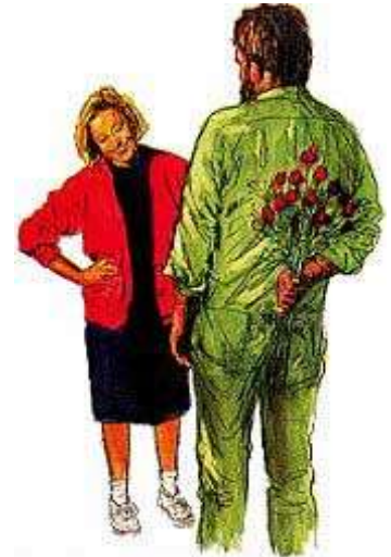
Surprise each other with little gifts.

Answer: Has love almost disappeared from your home? The devil (that notorious home-breaker) is responsible for this. Don't forget that God Himself joined you together in marriage, and He intends for you to stay together and be happy. He will bring happiness and love into your lives if you will obey His divine rules (commandments). "With God all things are possible." Matthew 19:26. Don't despair. God, who places love in the heart of a missionary for a leprous savage, can easily give you love for each other if you will let Him.