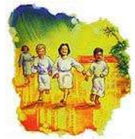
Children, playing together, will fill the streets of the new Jerusalem.

Answer: Yes, there will be many boys and girls in the holy city (Isaiah 11:6-9), and these youngsters will grow up (Malachi 4:2). We have degenerated much in stature, intellect, and vitality since Adam, but all of this will be restored (Acts 3:20, 21).