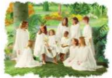
In His new kingdom the Lord will personally live among His people.

F. Jealousy, fear, hatred, falsehood, envy, impurity, cynicism, filth, worry, and all evil will be forever shut out of God's kingdom (Revelation 21:8, 27 22:15). People will no longer be burdened with the worries and the cares that drive them to distraction. There will be no more nervous breakdowns. Time will become eternity, and the pressures and deadlines of earth will be gone forever.