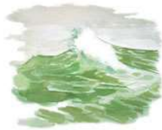
Today's mammoth oceans will not exist in God's new kingdom.

be the case in God's new kingdom. The whole world will be one huge garden of unsurpassed beauty, interspersed with lakes, rivers, and mountains (Revelation 22:1 Acts 3:20, 21).