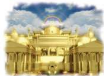
God is the architect and builder of the holy city.

"Wherefore God is not ashamed to be called their God: for he hath prepared for them a city." Hebrews 11:16.