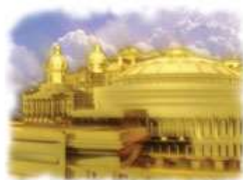
God's amazing city is located in heaven, His dwelling place.

Answer: The Bible declares that God is building a great city for His people. And this city is as real and literal as any you have ever known.