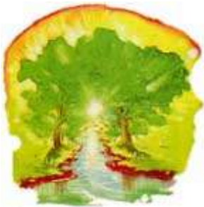
Heaven's fantastic tree of life brings unending life and youth to all who eat of it.

"The holy city, ... prepared as a bride adorned for her husband." "Having the glory of God: and her light was like unto a stone most precious, even like a jasper stone, clear as crystal." "The length and the breadth and the height of it are equal [proportionate]." Revelation 21:2, 11, 16. The city, with all of its precious stones, gold, and shimmering beauty, will be lighted with the glory of God. In its breathtaking majesty and purity it is compared to "a bride adorned for her husband."