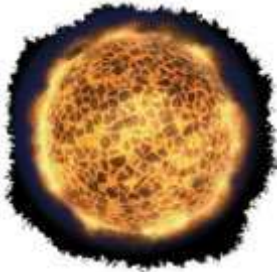
Sin and sinners will be eradicated by fire from God.

Answer: Yes, the majestic holy city will come down to this earth to become the capital of the earth made new. All the righteous will have a home in this city.