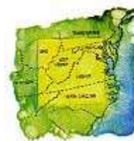
Notice the city's size compared to several states.

"The city lieth foursquare, and the length is as large as the breadth: and he measured the city with the reed, twelve thousand furlongs." Revelation 21:16. The city is perfectly square. Its perimeter is 12,000 furlongs, or 1,500 miles (a furlong is 1/8 mile). It is 375 miles long on each side.