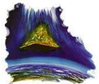
The holy city will descend to earth and become its capital.

"And I John saw the holy city, new Jerusalem, coming down from God out of heaven, prepared as a bride adorned for her husband." Revelation 21:2. "Blessed are the meek: for they shall inherit the earth." Matthew 5:5. "The righteous shall be recompensed in the earth." Proverbs 11:31.