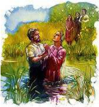
Baptism is the marriage ceremony that weds me to Christ.

Answer: Do not mistake obedience for legalism. Legalism is trying to earn salvation by good works. The saints are identified in the Bible as having four characteristics: (1) keeping the commandments, (2) trusting the blood of the Lamb, (3) sharing their faith with others, and (4) choosing to die rather than to sin. These are the true marks of the person who is in love with Christ and who has made a life commitment to follow Him.