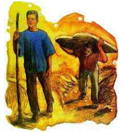
Keeping the Ten Commandments in an attempt to earn salvation will result only in sorrow and despair. But the person who has experienced the gift of salvation delights in walking the path of obedience to God's laws.

Answer: No love affair can prosper without communication. Prayer and Bible study are absolutely essential to keep this relationship growing. His Word constitutes a love letter that I must read daily to nourish the spiritual life. Conversing with Him in prayer deepens the devotion and opens my mind to a more thrilling and intimate knowledge of His concern for me. Daily I am amazed to discover details of His incredible provision for my happiness.