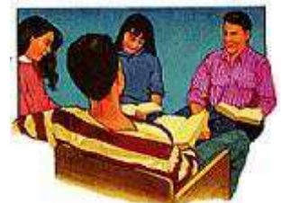
My love for Jesus deepens as I share it with others.